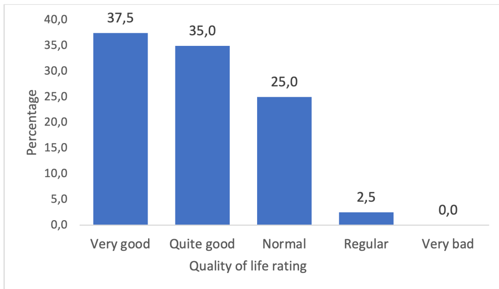
Figure 2. Satisfaction with health status among device users. Medellín, Colombia, 2024.